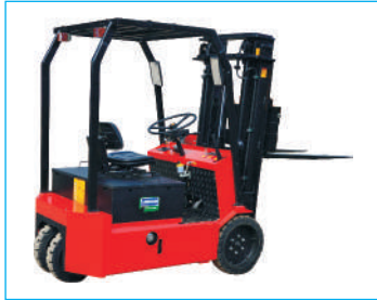
Capacity: Up to 2,000 kgs