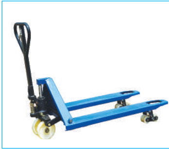
Capacity: 2,500 kgs /3,000 kgs