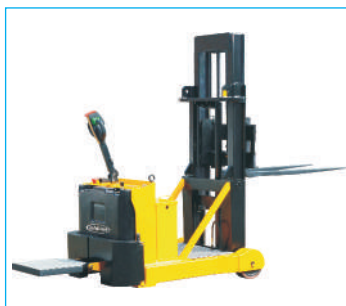
Capacity : 1,000 / 1,500 kgs