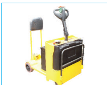
Capacity: Upto 2,000 kgs