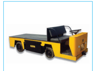
Capacity : 4,000 kgs