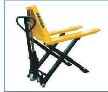
Capacity: 1,000 kgs