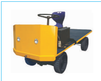
Capacity : 2,000 / 3,000 kgs