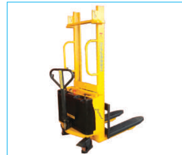
Capacity: 1,000 / 1,500 kgs