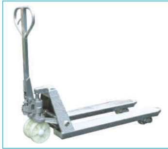
Capacity: 2,500 kgs