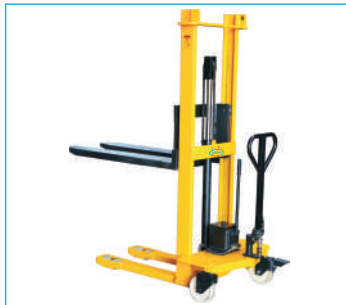
Capacity: 1,000 kgs