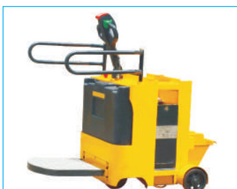
Capacity: Upto 3,000 kgs