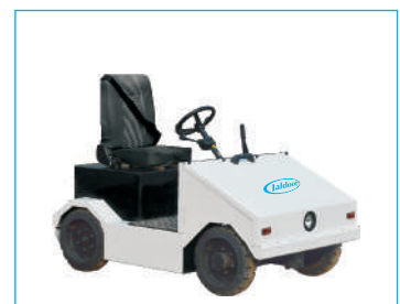
Capacity: Upto 10,000 kgs