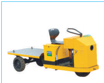
Capacity : 2,000 / 3,000 kgs