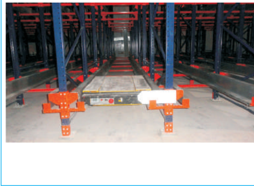
Pallet Mover (Radio Shuttle)