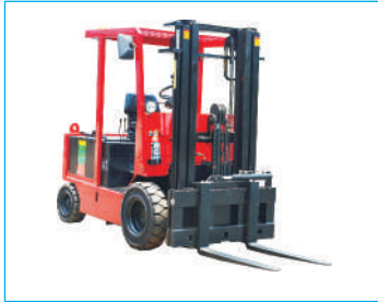
Capacity: Upto 5,000 kgs