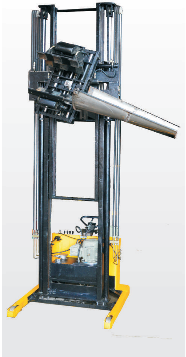
Hydraulic Operated Drum Handler