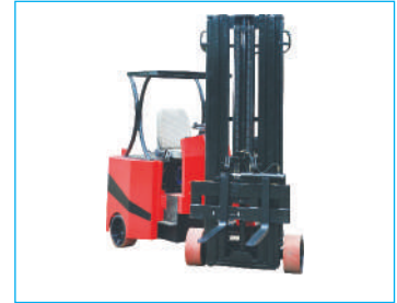
Capacity: Upto 2,000 kgs and Lift : upto 12 m