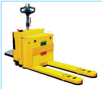
Capacity: 2,000 / 2,500 / 3,000 kgs