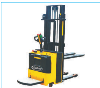
Capacity : 1,000 / 1,500 / 2,000 kgs