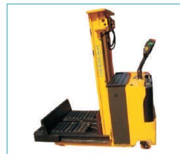
Capacity : Upto 1,000 Kgs.