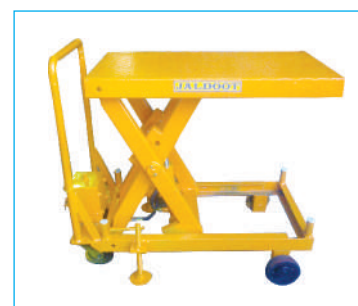
Mobile Scissor Lift