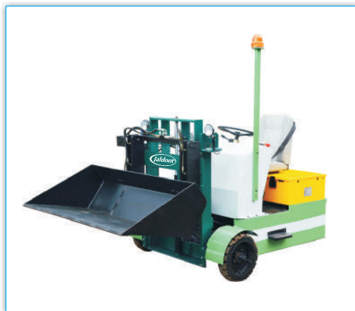
Battery Operated Shovel